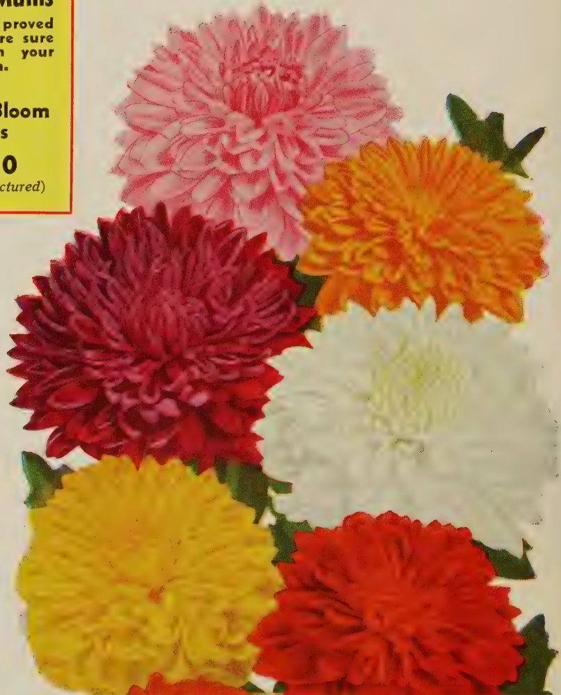
Top: CECIL BEED 60c each; 3 for $1.50